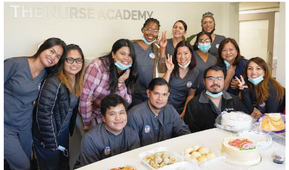
The Nurse Academy prepares future nurses for a rewarding and meaningful career delivering exceptional patient care.