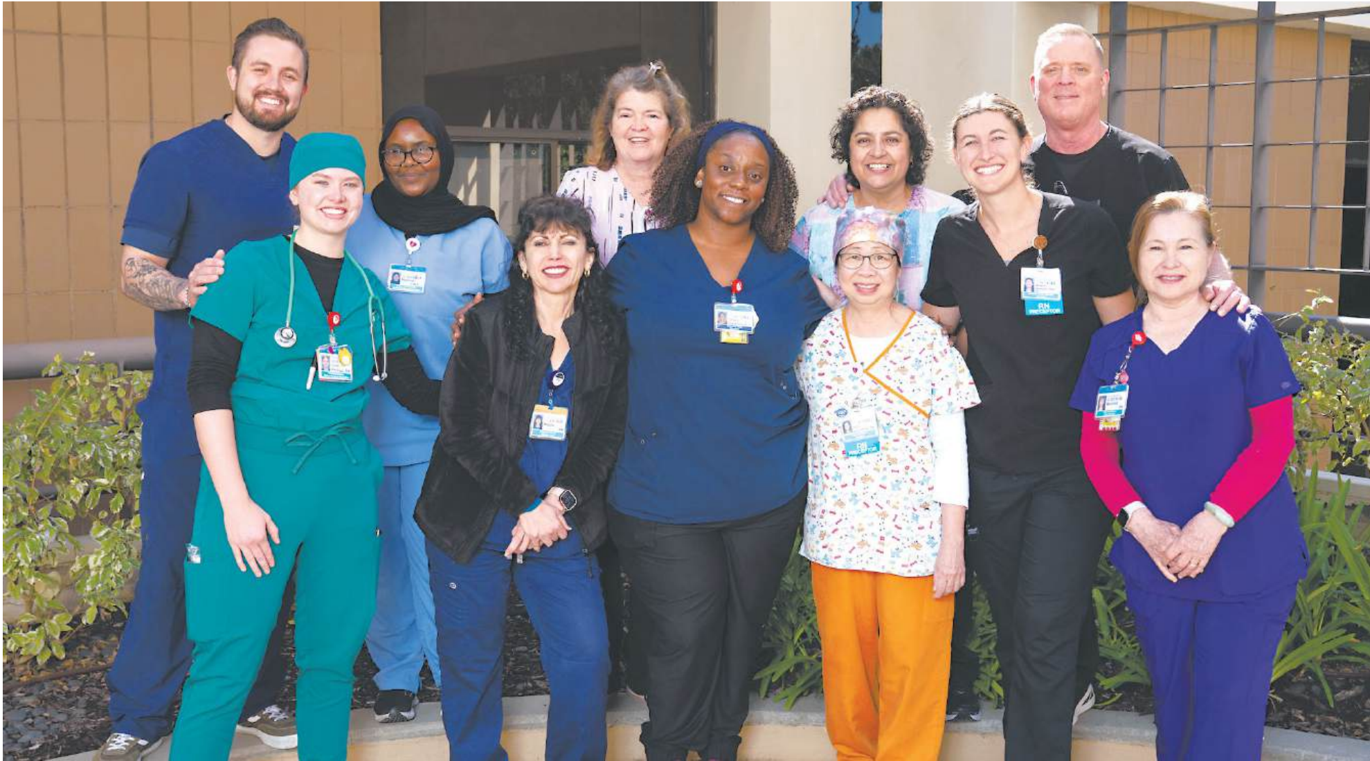
Members of the UC San Diego Health East Campus nursing team.